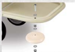
Model 1603-BE Corner bumpers, field fit kit. (For gray order 1603-GY)