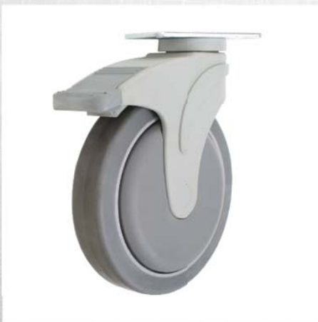
6" Tracking casters with locking wheels