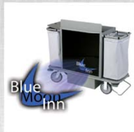
Custom logo panel, call for more information