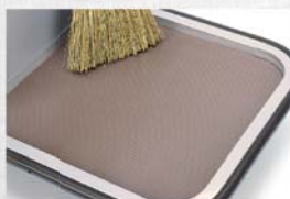
Model 1401 Ribbed vinyl deck mat for steel carts only