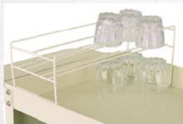
Model 2331-B Vinyl dipped glass rack