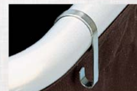
Model 39 Spring steel bag clips for grommet style bags