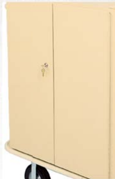
Model 2344 Double plastic locking doors For single plastic locking door order #2344-C