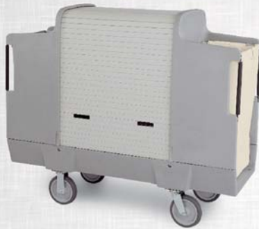
Available in Beige or gray