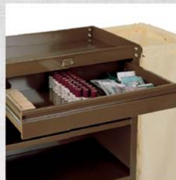
Model 2324 Metal amenity drawer 4" deep