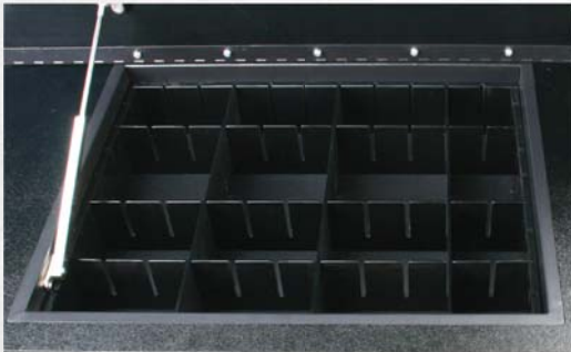
Built-in top tray compartment with adjustable inserts