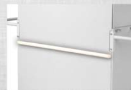
Back Bumper Vinyl back bumper, call for more information