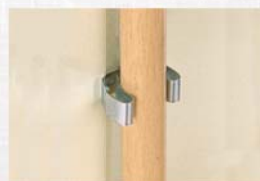
Model 2366 Spring steel clips secure mop and broom handles