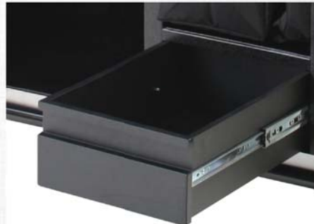
High capacity amenity drawer