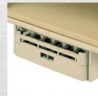
Model H1119 Under-deck glass rack holder