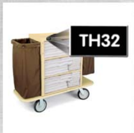
Cart identification tags, call for more information