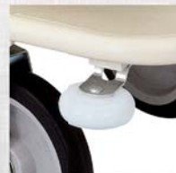
Model H1146 Donut bumper kit