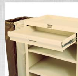
Model 2325 Plastic amenity drawer 4" deep