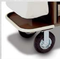
Model H114903 Wrap bumper