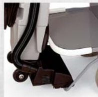
Model H1179 Under-deck vacuum bracket