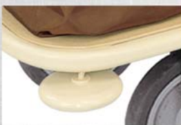
Model 2337 Corner bumpers, factory installed