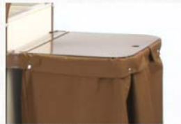
Model 2336 Steel bag lid