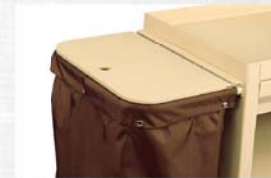
Model 2336-P Plastic bag lid