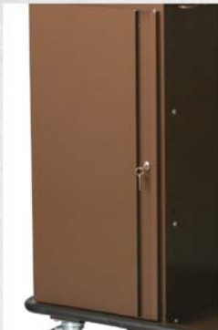
Model 2343 Single metal locking door For double metal locking door order #2341